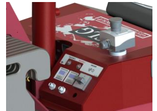
GLG built-in vacuum system