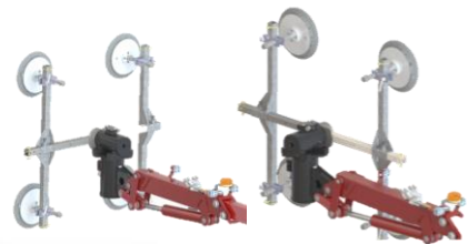
± 90° turning and endless rotation of the center boom